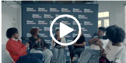
Silence the Shame Podcast x YAC presents: Finding Support When the Holidays Feel Hard