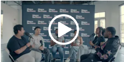
Silence the Shame Podcast x YAC presents: The Power of Rest: Why Young People Need to Slow Down